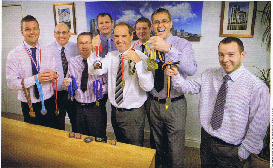
> The A&B team has completed many endurance events to raise money for charity